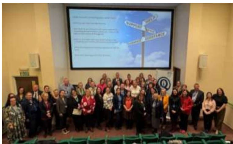
AAIFS Cohort 10 Graduation Group Photo

To date 280 members of staff from across NHS Ayrshire and Arran have graduated from the AAIFS programme. The faculty are undertaking a period of course evaluation to determine next steps for the course in 2025.